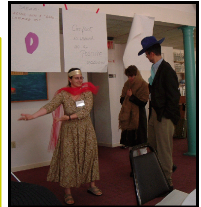
Fun at the MADRP Spring Conference on Appreciative Inquiry